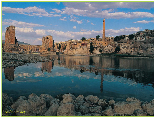
Figure: HasanKeyf is under danger of hydro electrical power plant

• Arif KARAHALIOGLU WASTE alumnus generation 2010